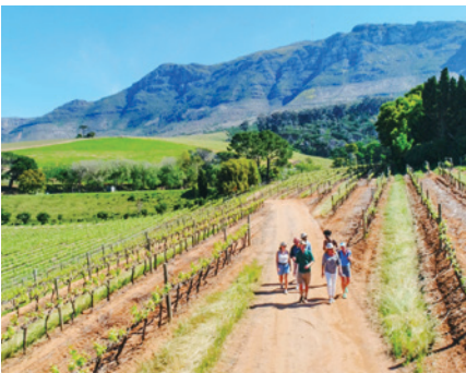
FROM LEFT: MOUNT NELSON, A BEL-MOND HOTEL IN CAPE TOWN; VINEYARD ON THE CONSTANTIA WINE WALK.

Base yourself at Cape Town's grande dame, Mount Nelson, a Belmond hotel (belmond.com), which celebrated its 125th anniversary earlier in 2024. The history-steeped, 198-key, pink landmark is an exercise in timeless glamour with soothing, understated interiors that focus on hightouch details and, in many cases, face the grandeur of Table Mountain. Enjoy the likes of traditional afternoon tea in the Lounge, sundowners at the Planet Bar, and relaxing