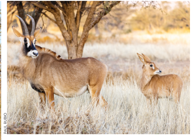
OBSERVE MORE TYPICAL SAFARI GAME LIKE GIRAFFES AND MORE UNCOMMON CREATURES LIKE ROAN ANTELOPES IN TSWALU.

Beyond wildlife encounters, Tswalu offers a deep dive into the Kalahari's ecology, with knowledgeable rangers and guides sharing insights gained from ongoing research projects and decades of experience. It's also a chance to luxuriate in one of Earth's most singular settings, especially given the vistas and amenities at Loapi. It can be a challenge to leave the confines of your high-design, steel-and-canvas domain, where you marvel at the terrain from your open-air dining room, sunken fire pit, or plunge pool, endless pour of fine South African wine in hand. Interiors are unapologetically cozy with plush couches, a wooden fireplace, and reading and sleeping nooks aplenty. Each is an idyllic place to lounge as chef surprises with sublime snacks and meals using regionally sourced ingredients, and homathi delights by catering to your every whim. At Loapi, each meal is beautifully tailored and presented as well as exquisite in taste.