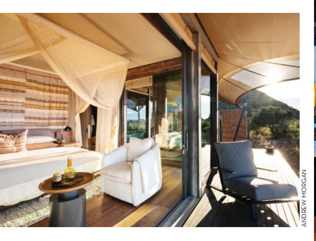
CLOCKWISE FROM ABOVE: HIGH-DESIGN HOMES AT LOAPI SHOW-CASE TRANSITIONAL INDOOR-OUTDOOR SPACES AND CONSTANT VIEWS OF THE KALAHARI; EXPERIENCE HERITAGE NORTHERN CAPE CUISINE AT RESTAURANT KLEIN JAN; MINGLE WITH THE RESIDENT MEERKATS AT TSWALU—AT EYE LEVEL (BOTTOM LEFT).